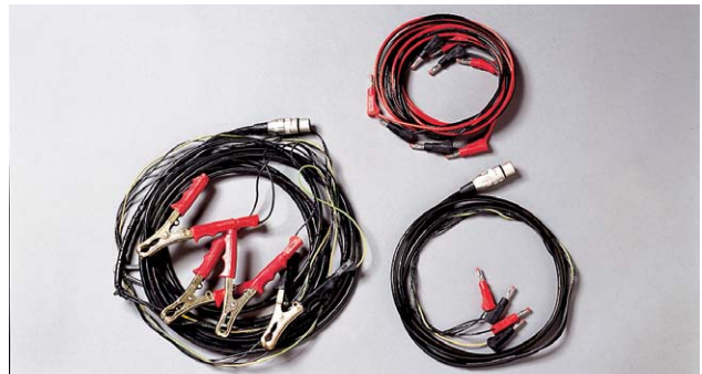
Multicable sets GA-00160 and GA-00170 and cable set GA-00082