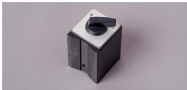
Switch magnetic base