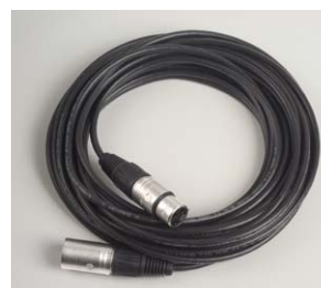
Extension cable XLR, GA-01005