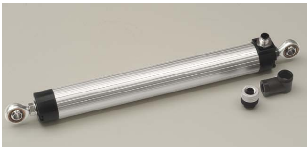
Linear transducer, LWG 150