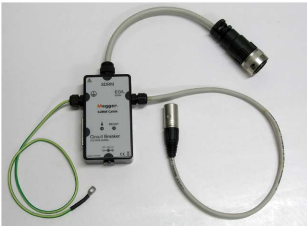
The SDRM Cable