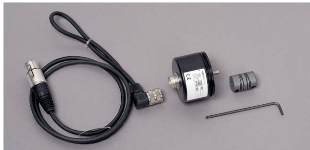
Rotary transducer, Novotechnic IP6501 (analog)