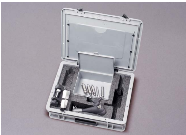
Rotary transducer mounting kit