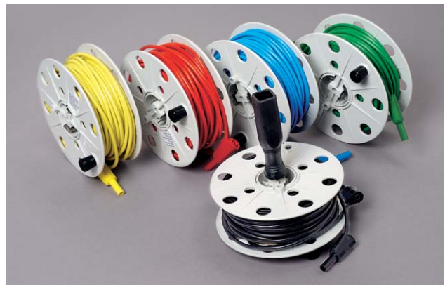
Cable reels, 20 m (65.5 ft), 4 mm stack-able safety plugs