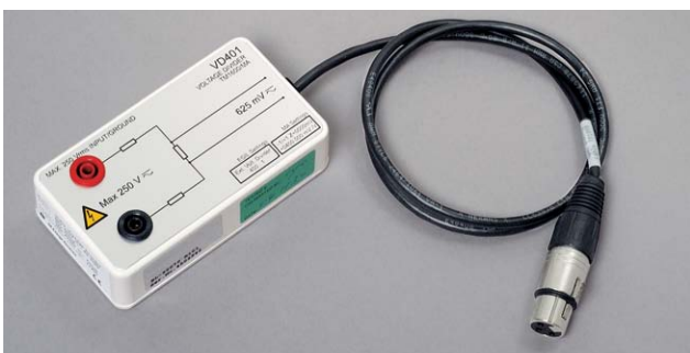
Voltage divider, VD401