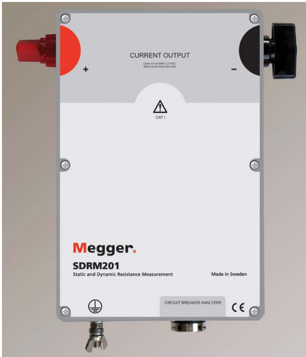
The SDRM201 is intended to use for both static and dynamic resistance measurements (SRM and DRM) on high voltage circuit breakers or other low resistive devices