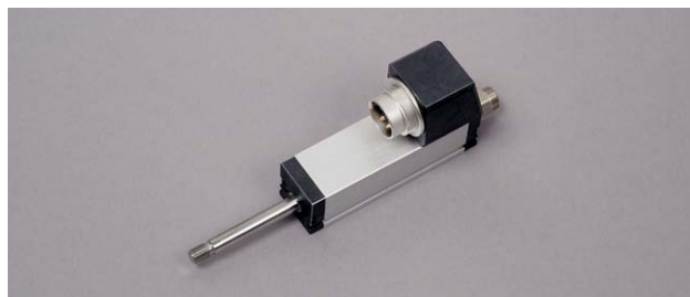
Linear transducer, TS 25