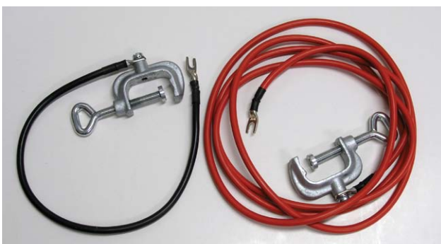
Current cables for SDRM201, the red cable is 3.0 m (9.8 ft) and the black one is 0.5 m (1.6 ft)