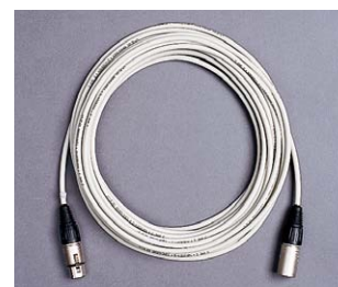
Extension cable XL, GA-00150