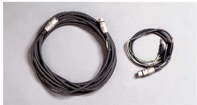
Transducer cables GA-00041 and GA-00042