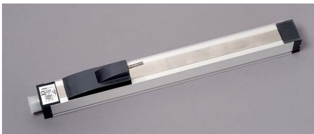
Linear transducer, TLH 225